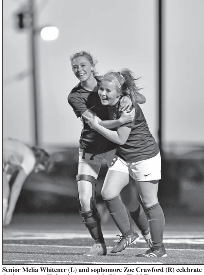
during a recent Union County match.

Should the Panthers advance to this year's Sweet 16, they would face the winner of Region 2's runner-up (likely No. 10 Woodville-Tompkins [9-3-1], Bacon County [8-3]